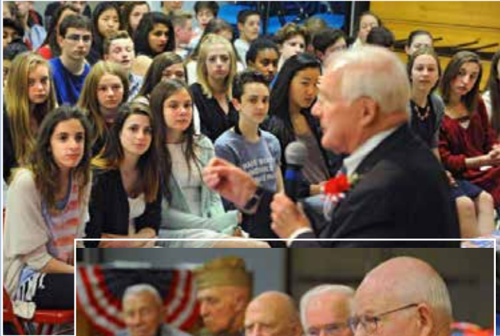
World War II veterans visited Iroquois Middle School on Friday to share their life experiences with students. The 7th and 8th grade choir performed to conclude the special day.